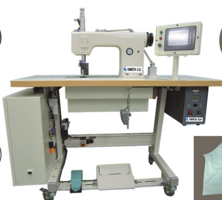
MODEL RHW 3007